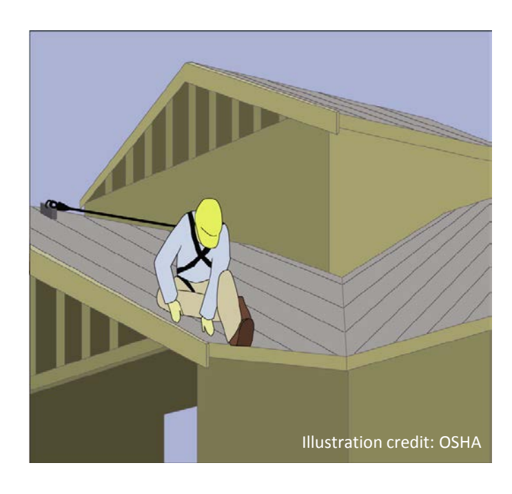
Illustration 1: Roofer using fall protection system