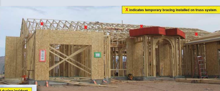
Photo 1: House in frame just after trusses erected and set. Stack of OSB above entryway to the right was being put into position when worker fell.