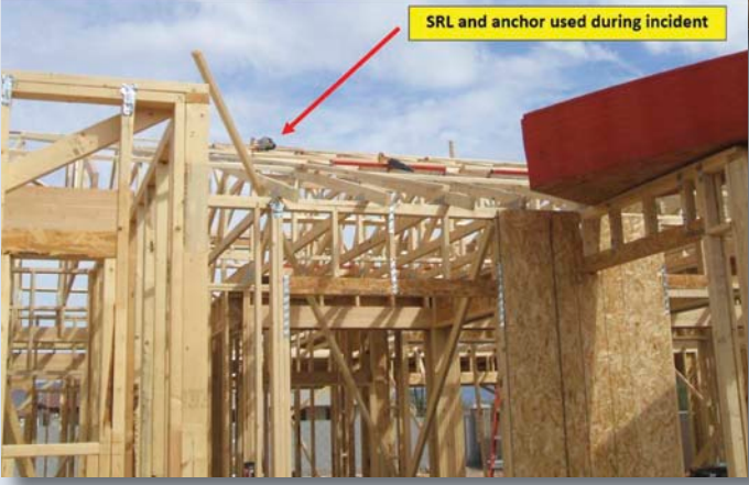
Photo 2: PFAS anchor and SRL used by the worker. All equipment left in place for photo.