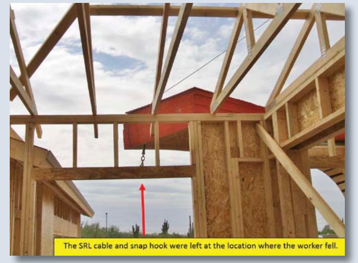
Photo 4: SRL cable and snap hook where fall was arrested. Note proximity to truss top chord and wall and path of lanyard over truss tail.