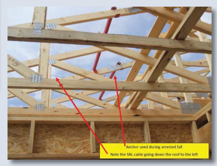
Photo 3: Underside of truss system and anchor used in arrested fall.