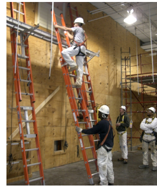
Workers receive training on ladder safety procedures.

The medical, wage, and quality-of-life costs of ladder-related deaths and injuries to society are enormous. For the families, friends, and co-workers the personal and emotional costs are immeasurable.