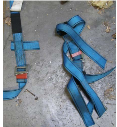
Harness cut from laborer

When the victim moved aside, he stepped onto two pieces of rotten plywood that were not nailed down, and the plywood pieces and unattached joist supporting them gave way. An investigation determined that his rope grab was attached near the end of his lifeline which left too much slack in the line allowing him to fall 30 feet to a concrete floor.